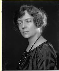
Alice Lee Roosevelt Longworth 2/12/84—2/20/80

was an American writer and socialite. She was the eldest child of U.S. president Theodore Roosevelt and his only child with his first wife, Alice Hathaway Lee Roosevelt. Longworth led an unconventional and controversial life.