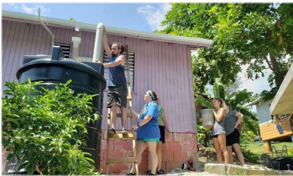
Jamaica Rainwater Catchment System

The Crescent Rotary Club led Global Grant to provide clean water to a village in Bluefields, Jamaica needs volunteers for the Jamaica trip.